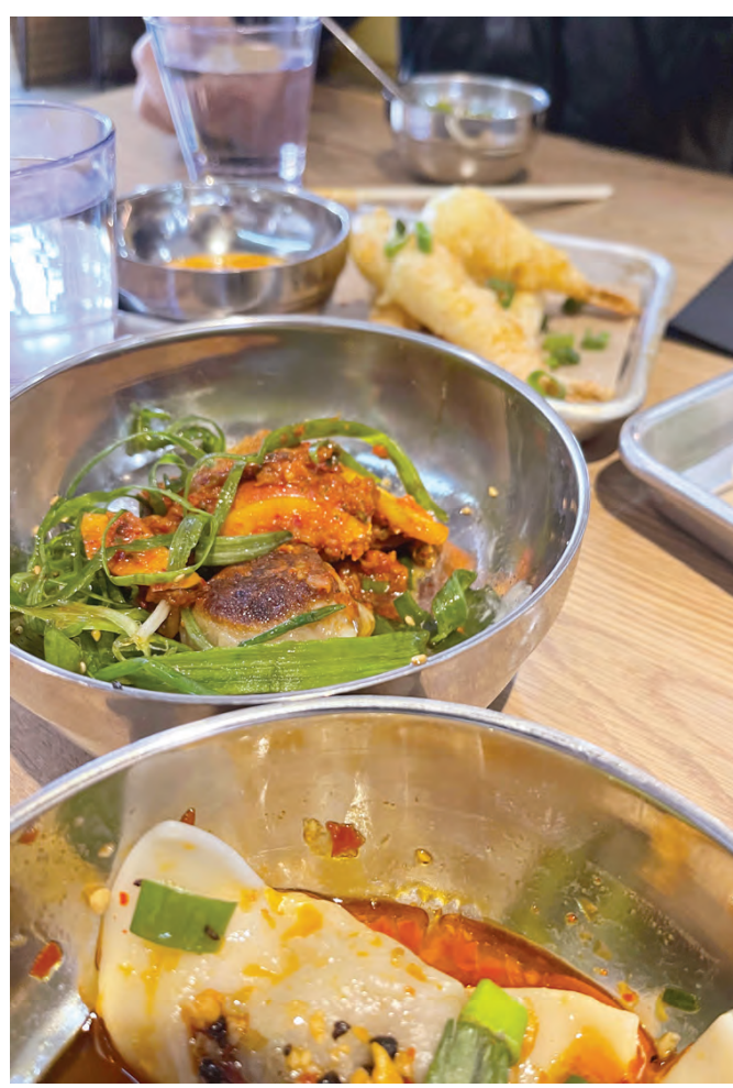
Chiko, the casual Chinese-Korean restaurant, expanded into Shirlington with its offerings of pork and kimchi potstickers, wok-blistered green beans and cumin lamb stir fry.