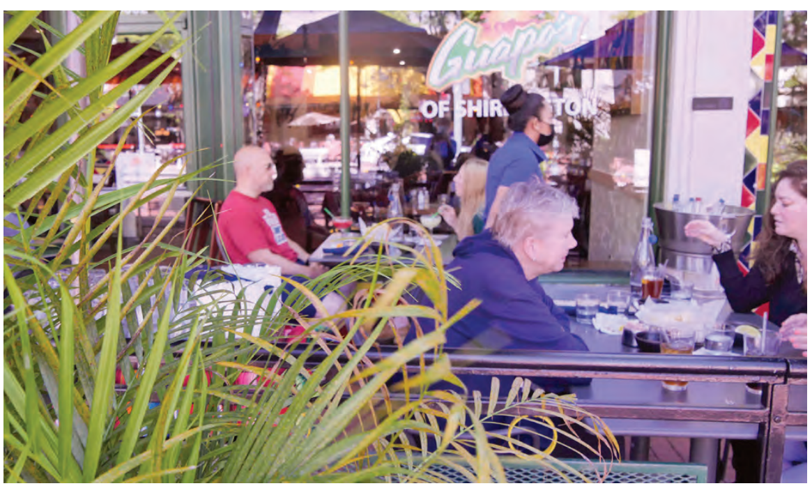
Guapa's is already hopping on a Monday at 11:30 am. The hostess says the customer favorites seem to be the fajitas and the taco salad.