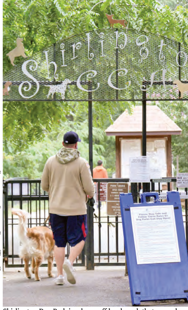
Shirlington Dog Park is a large off leash park that runs along a river with plenty of water stops and a paved walkway.