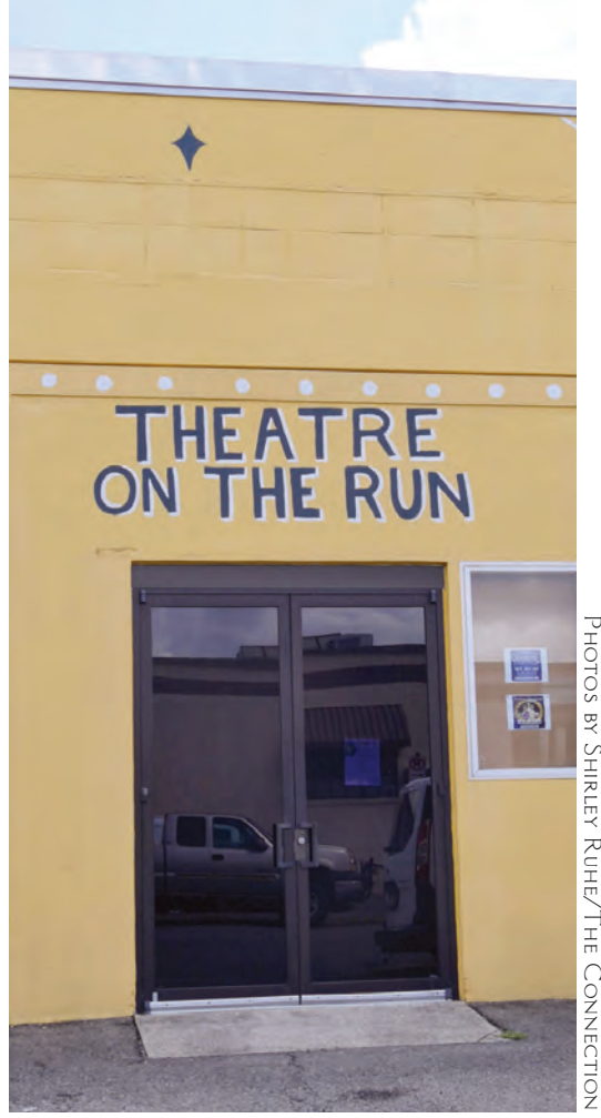
Shirlington is home to a vibrant arts and industrial district

And if none of these are appealing, there is always the AMC movie theatre a couple of blocks away.