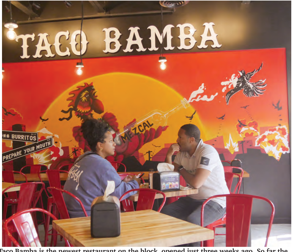
Taco Bamba is the newest restaurant on the block, opened just three weeks ago. So far the most popular has been the pork al pao pao taco and the torta cubana with carnitas, ham, cheddar and chihuahua cheese.