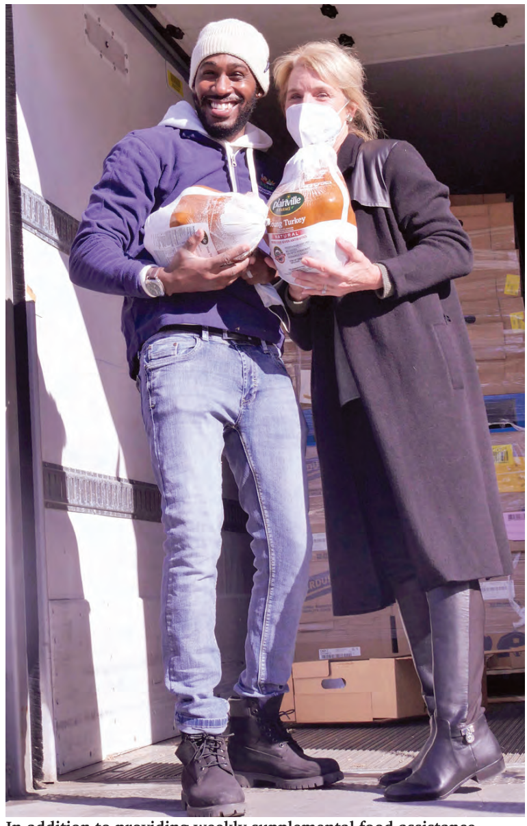
In addition to providing weekly supplemental food assistance, Arlington Food Assistance Center located on Nelson Street provides turkeys to the families each year at Thanksgiving.

16 ❖ Arlington Connection ❖ September 13-19, 2023